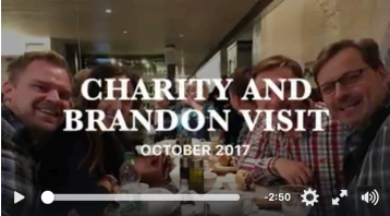
Yodises Meet the Butlers - click on the pic

Praise: We don't often get to see our daughter and son (in-law), so it was great to spend vacation time with them. We loved every moment. We went to see them in England and they returned to Ukraine with us for a few days. If you'd like to see the pictures, click here . (These pics will only be visible to all until the end of the month - after that, you will need to be "friends" with us on Facebook to see them.)