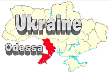
Click on the image to read about the new network in Odessa and the prayer requests that go with it.

Praise & Prayer: We are encouraging the group we work with to form networks of church planters and like-minded individuals in each of the oblasts (provinces) of Ukraine which will be led by a leader who will passionately promote church planting. In Odessa, we were able to see their network get a grand start at the end of October. To read more and see pictures of it, click here .